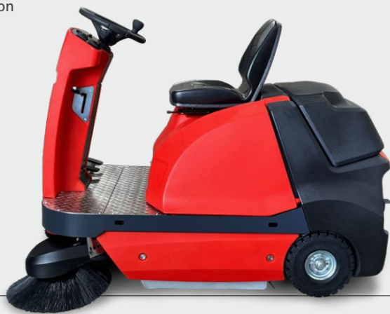
The TRS system