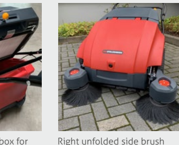
Opening of the dust box for throwing in large parts